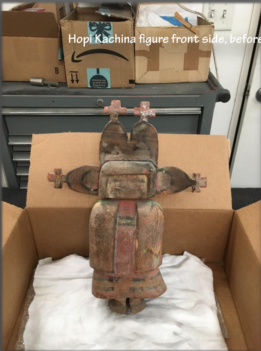
Hopi Kachina figure front side, before and after conservation treatment