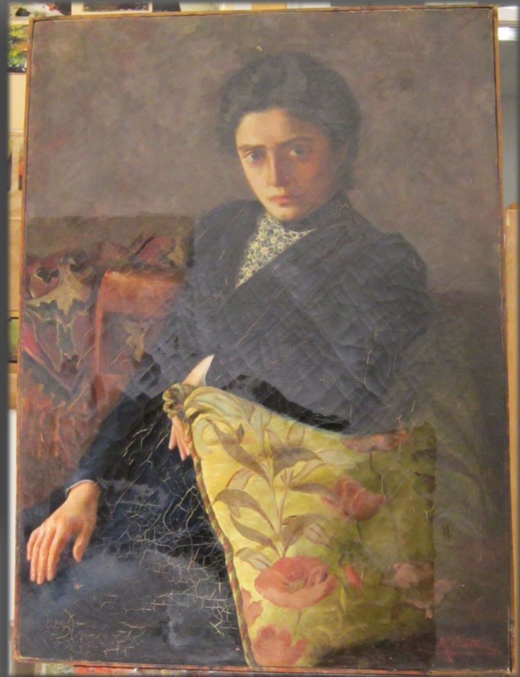
cleaning tests of an oil painting oxidized varnish