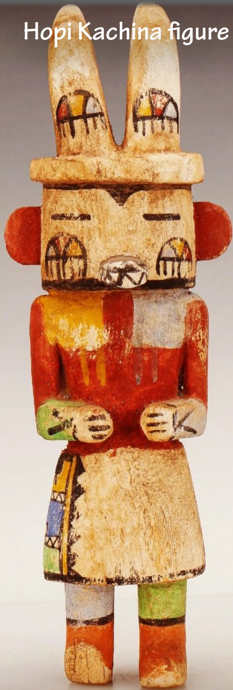
Hopi Kachina figure front side, before and after conservation treatment