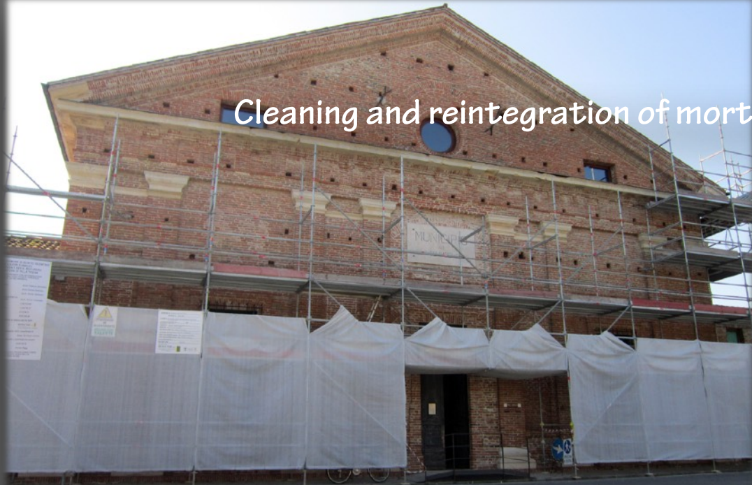
Cleaning and reintegration of mortar on the facade of Villa Thiene