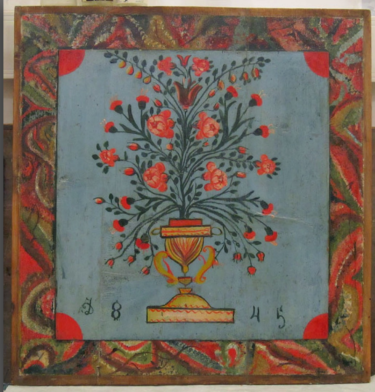
cleaning, consolidation and inpainting of 1800' painting on wooden board