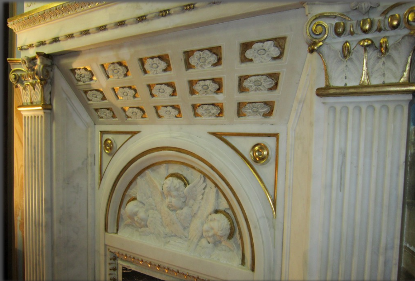
Edicola of Sant'Anna, before and after conservation treatments of marble architectural elements and gilded surfaces