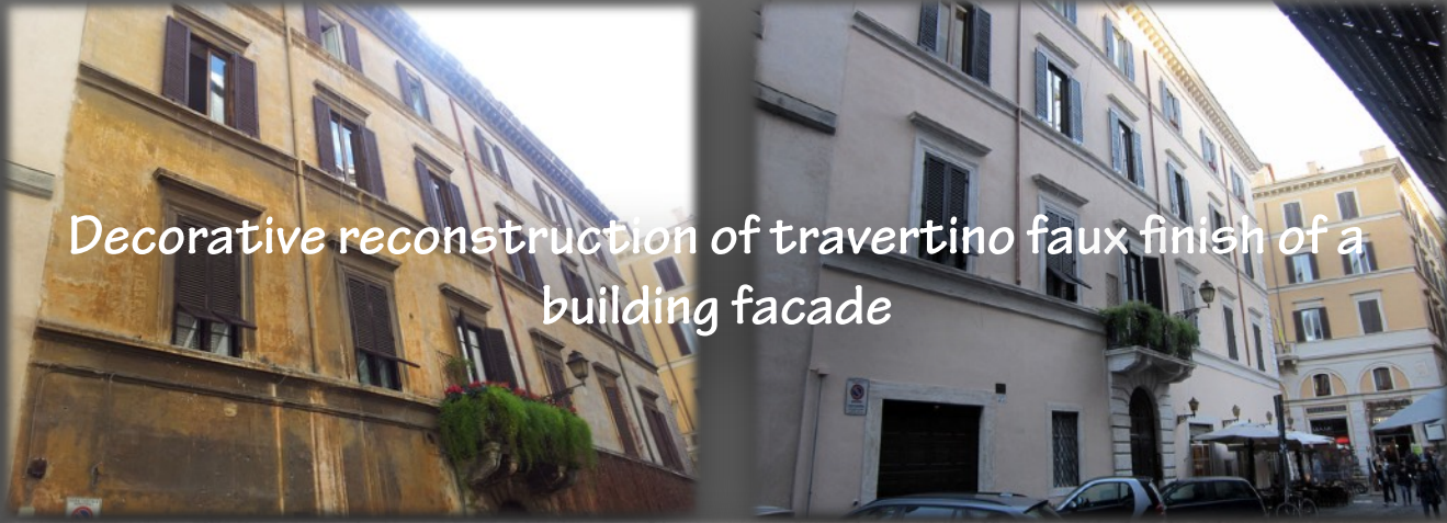
Decorative reconstruction of travertine faux finish of a building facade