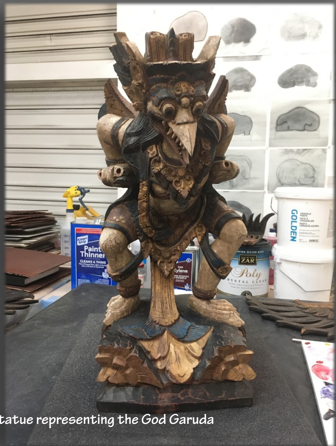
Restoration of Balinese wooden statue representing the God Garuda