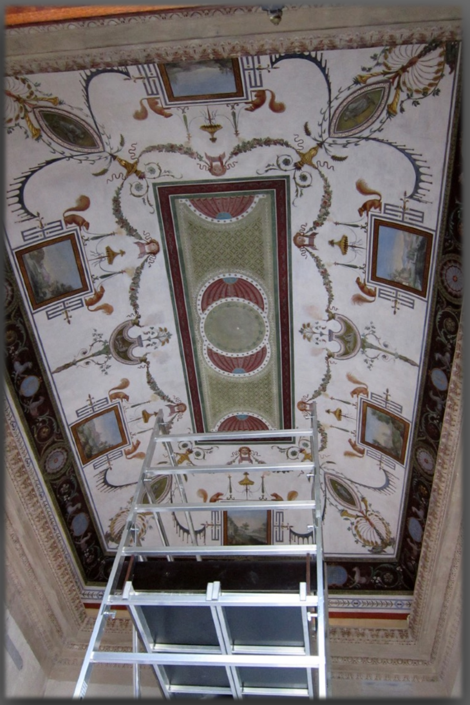
Restoration of Mural Paintings in Cordellina Palace