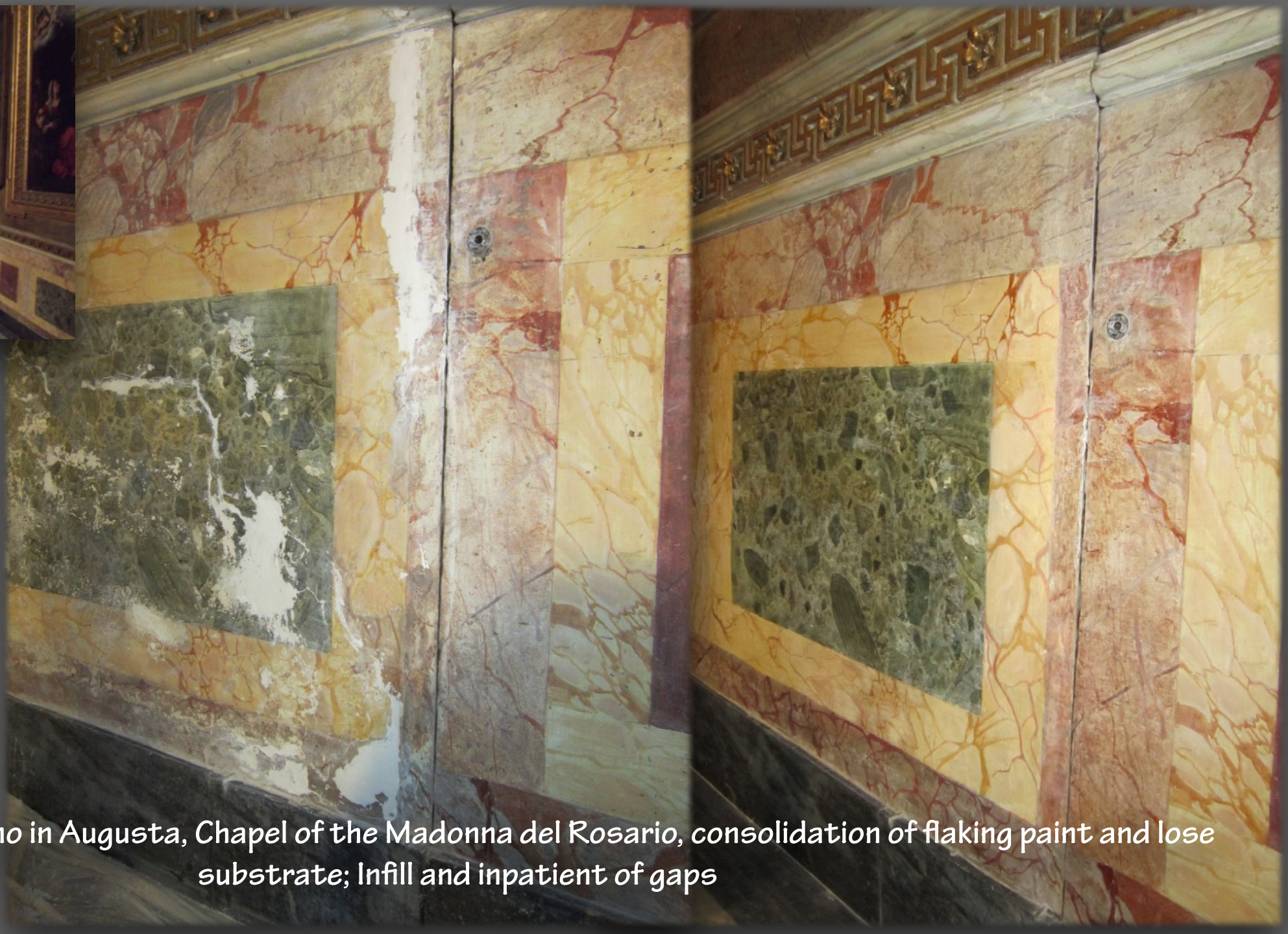
Church of San Giacomo in Augusta, Chapel of the Madonna del Rosario, consolidation of flaking paint and loose substrate; Infill and inpatient of gaps