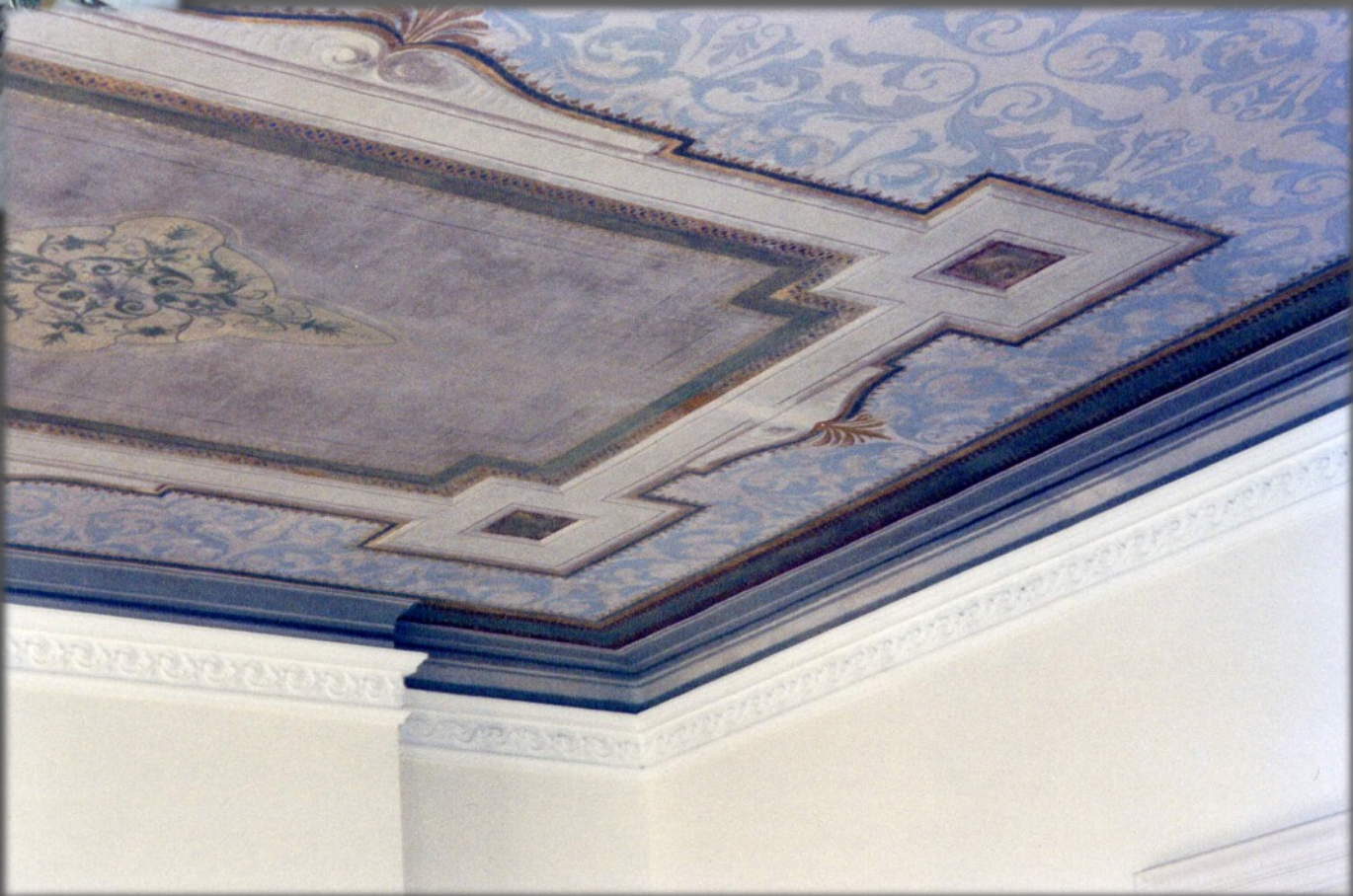
Conservation and restoration of decorative elements of an 1800' painted ceiling