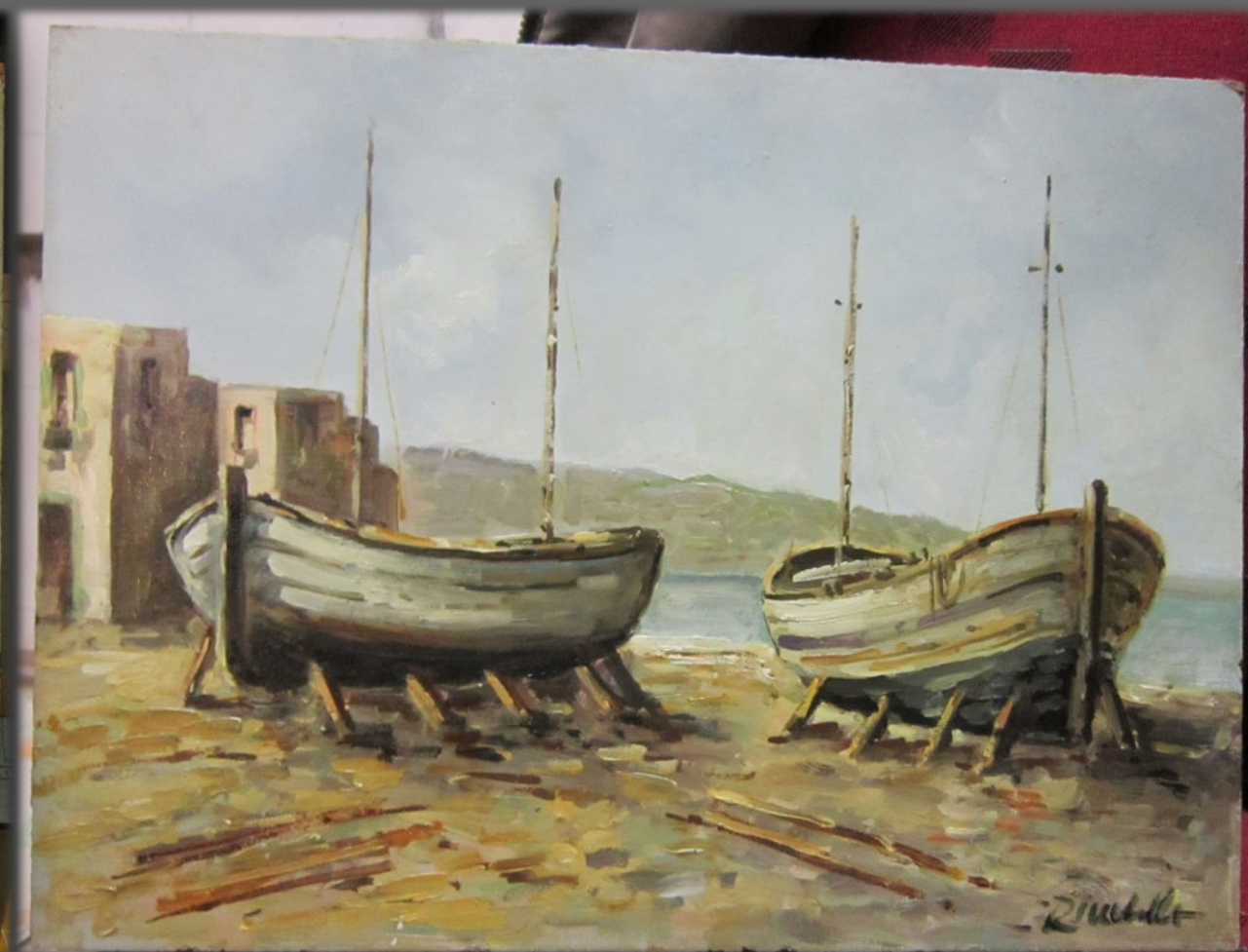
Cleaning of an oil painting on wood board