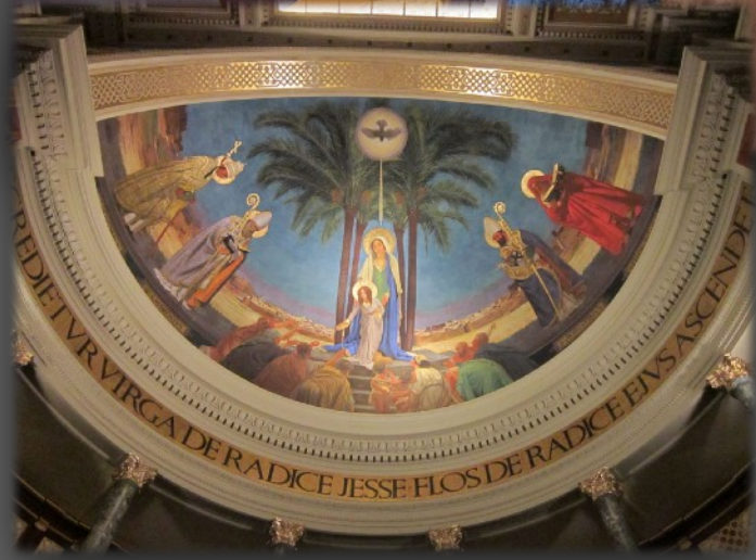
Consolidation and Restoration of dry fresco wall paintings in Sant'Anna Church, detail of apse mural