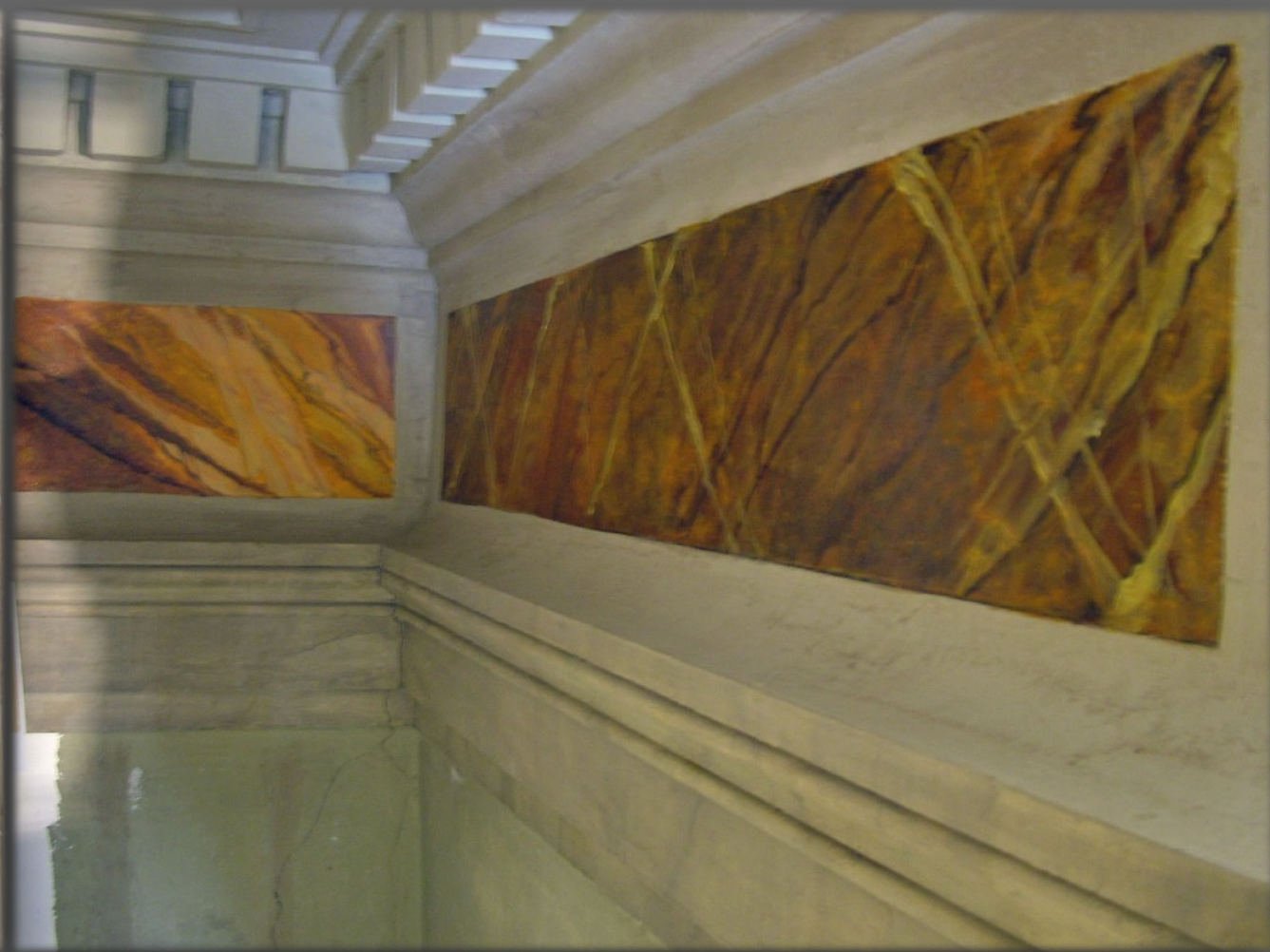
Sant'Anna Church stages of conservation and restoration treatments of wall faux finishes located on the wall's side facing the apse