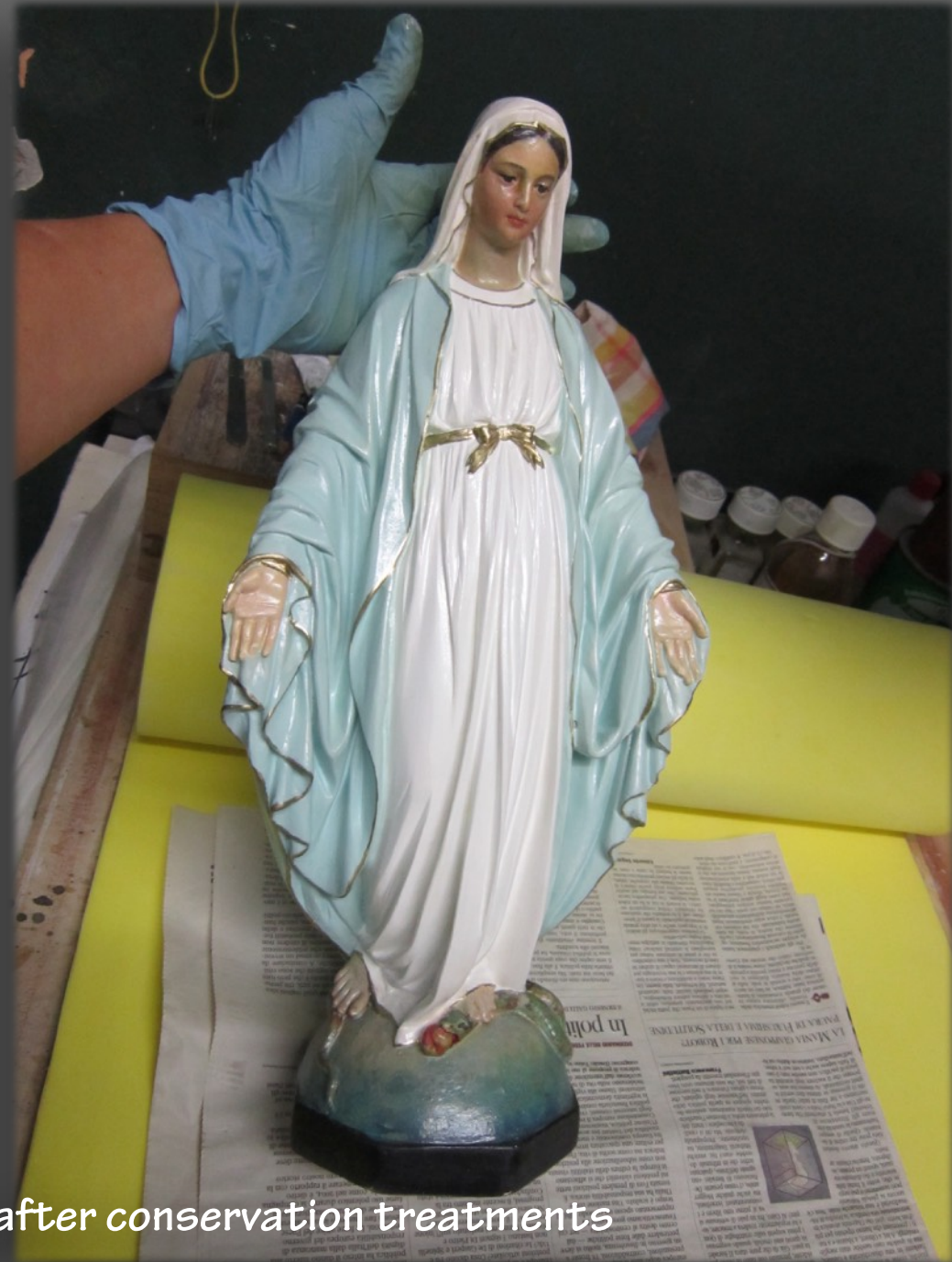
Virgin Mary Statue before and after conservation treatments