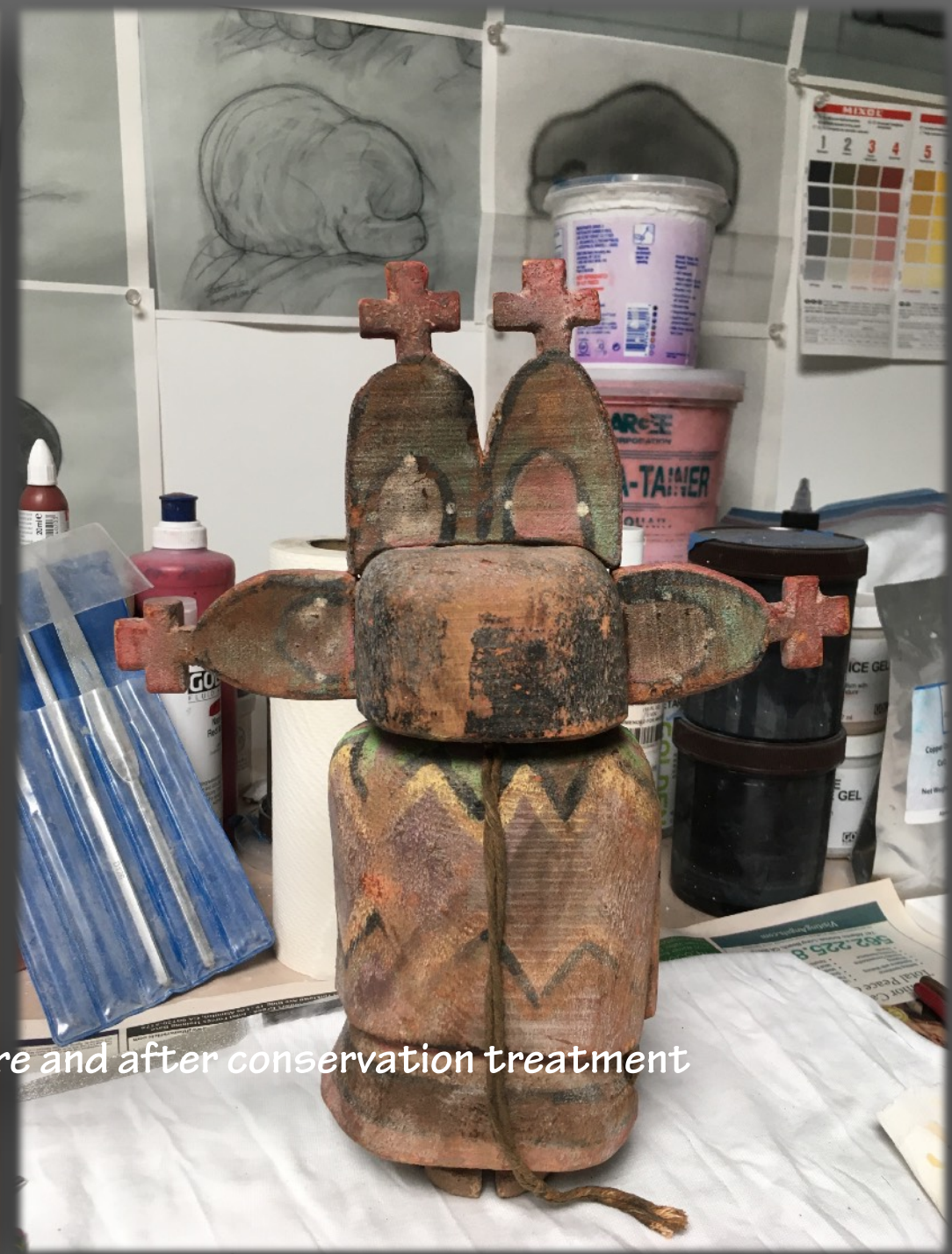
Hopi Kachina figure back side, before and after conservation treatment