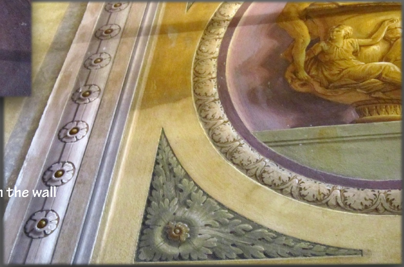
Palazzo Cordellina detail, cleaning of the fresco on the wall