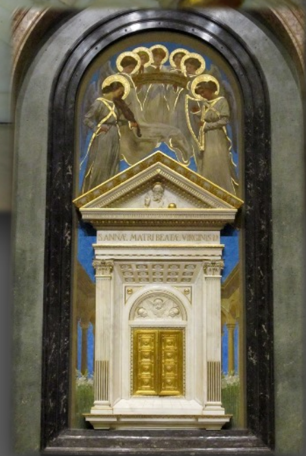
Edicola of Sant'Anna, before and after conservation treatments of marble architectural elements and gilded surfaces