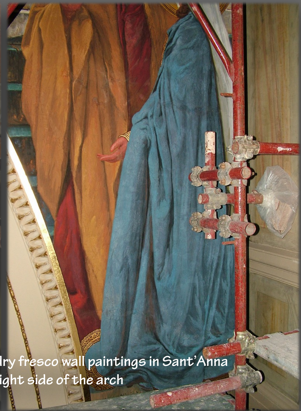
Consolidation and Restoration of dry fresco wall paintings in Sant'Anna Church, detail of right side of the arch