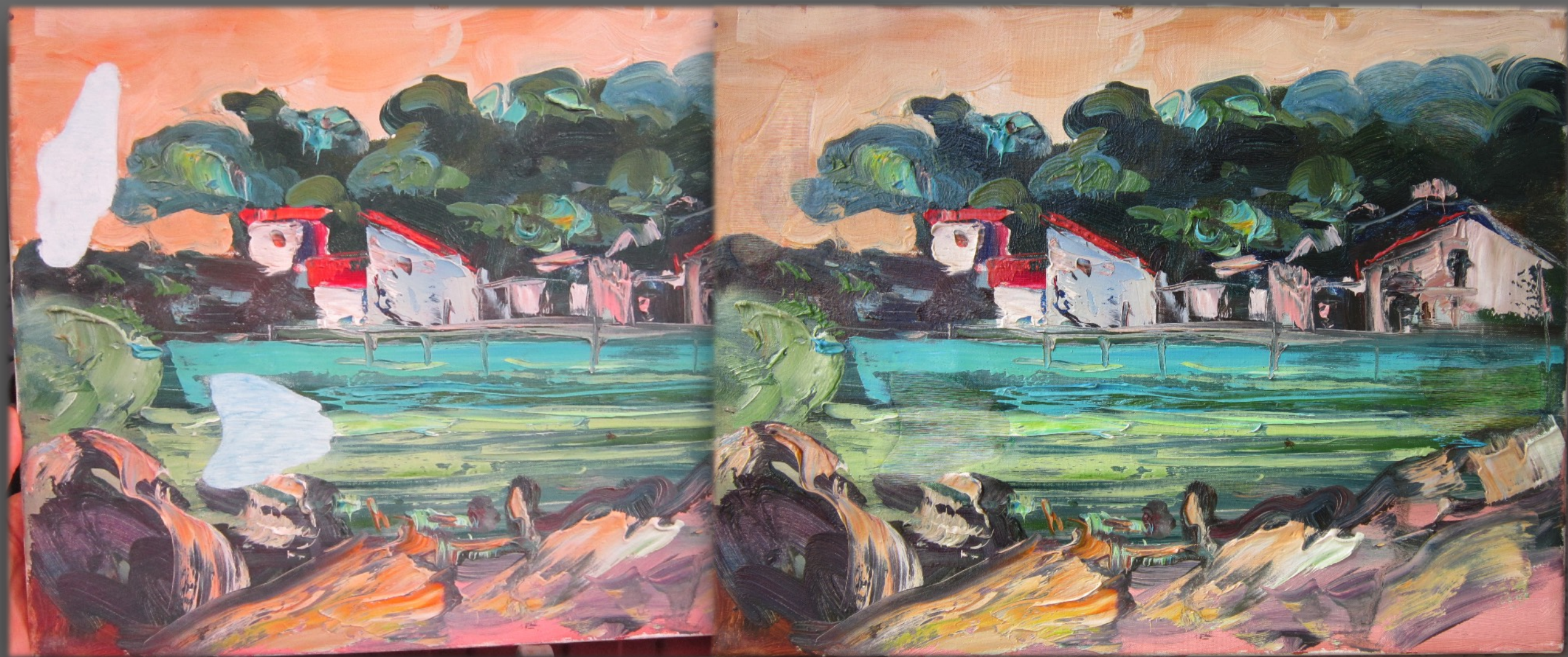
Pictorial integration of a contemporary painting