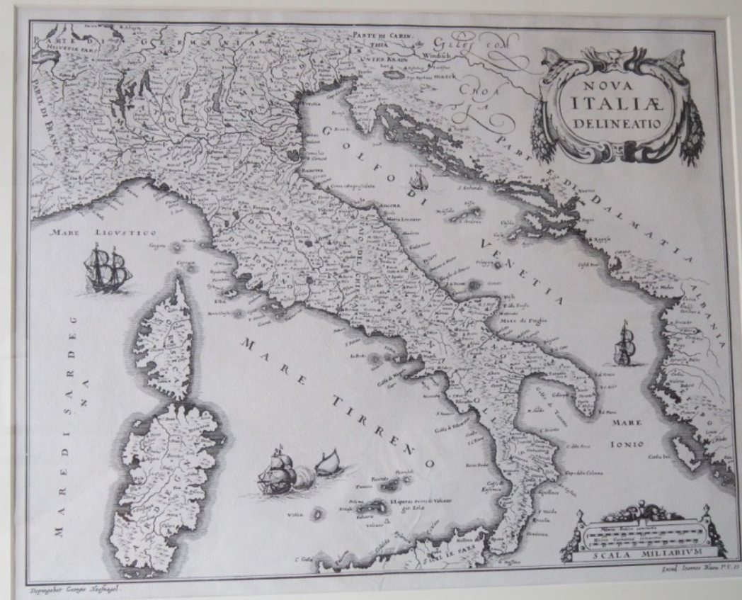
Cleaning and consolidation of a print on paper