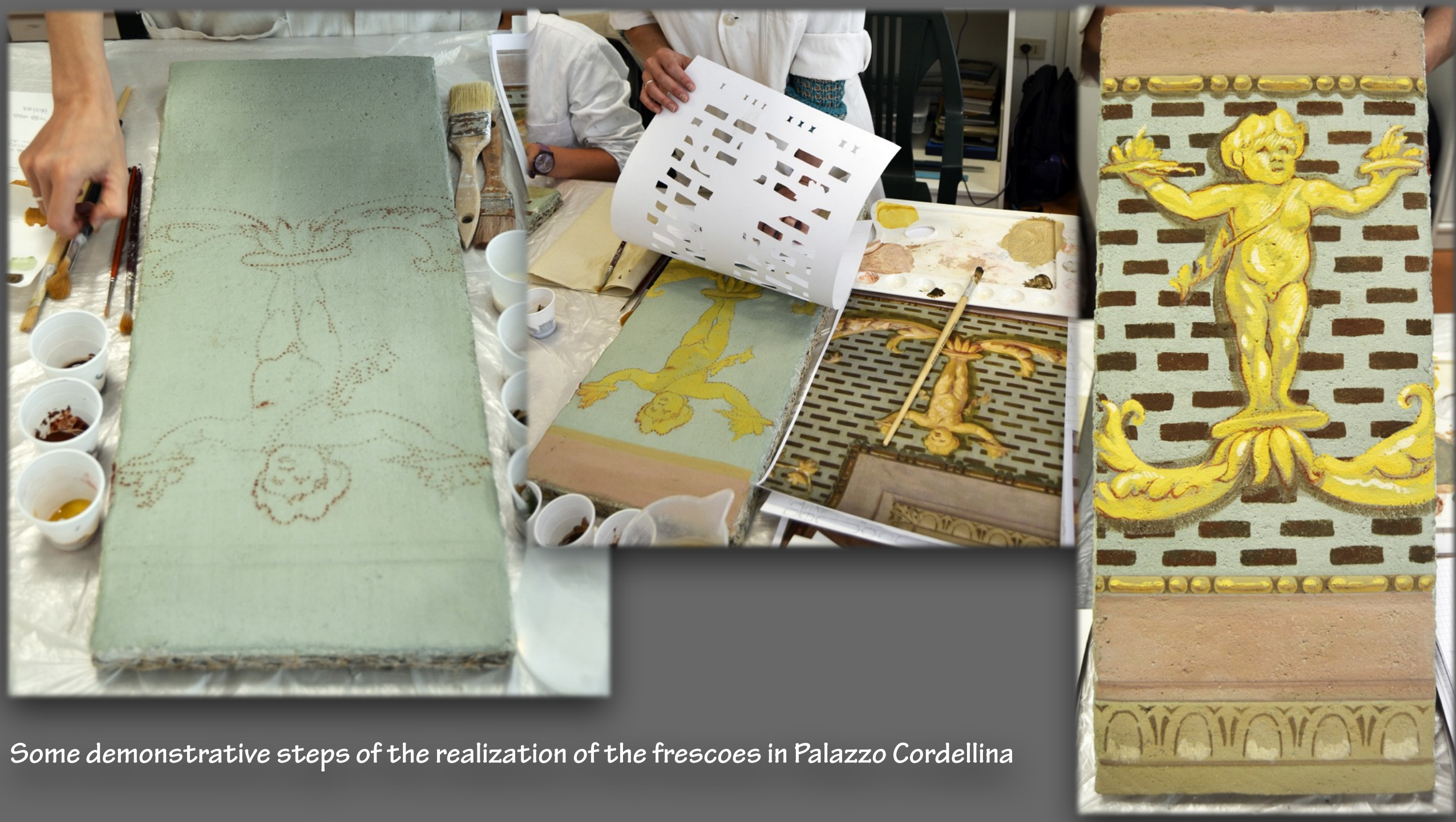
Some demonstrative steps of the realization of the frescoes in Palazzo Cordellina