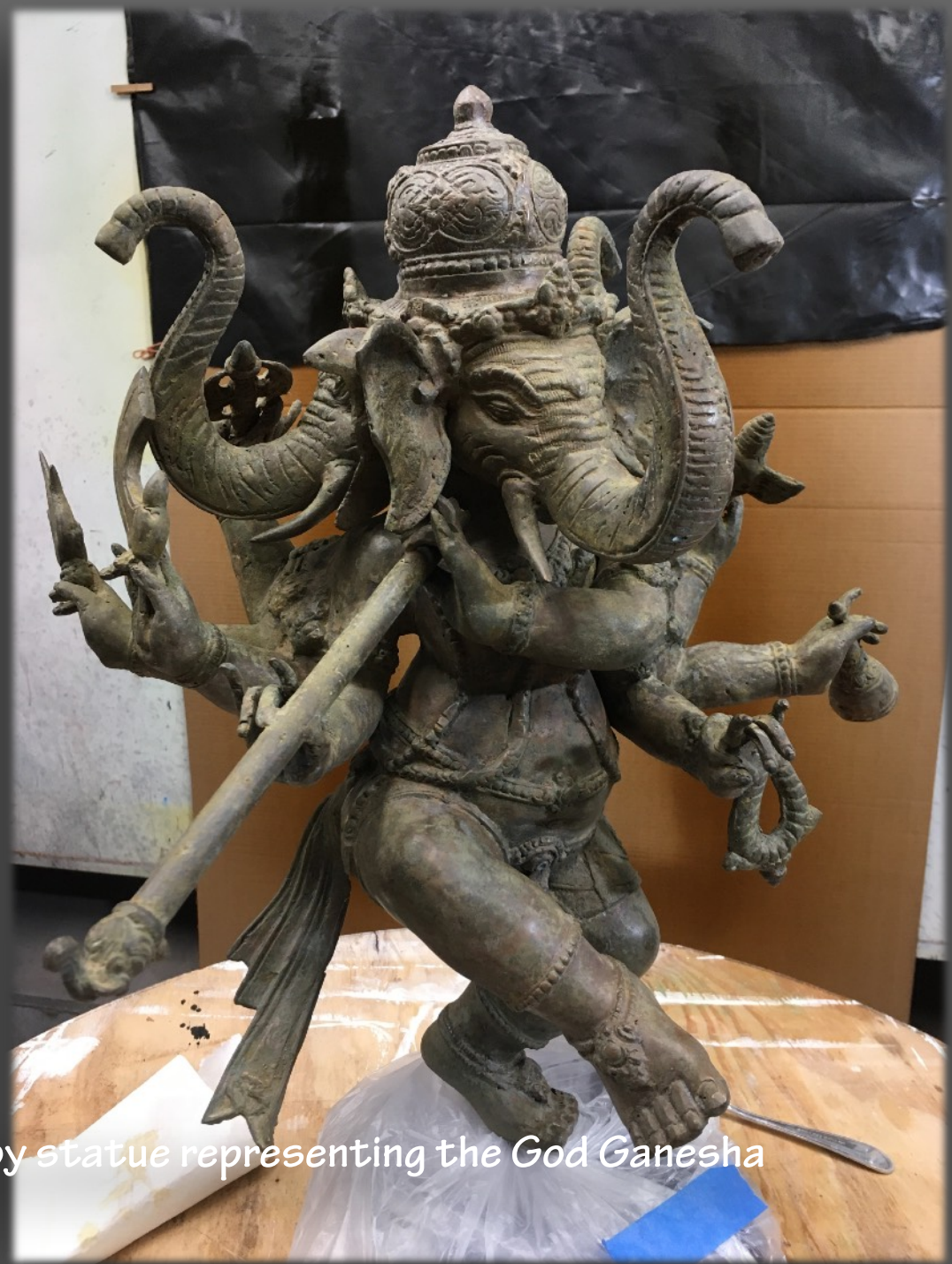
Restoration/Cleaning of Indu metal alloy statue representing the God Ganesha