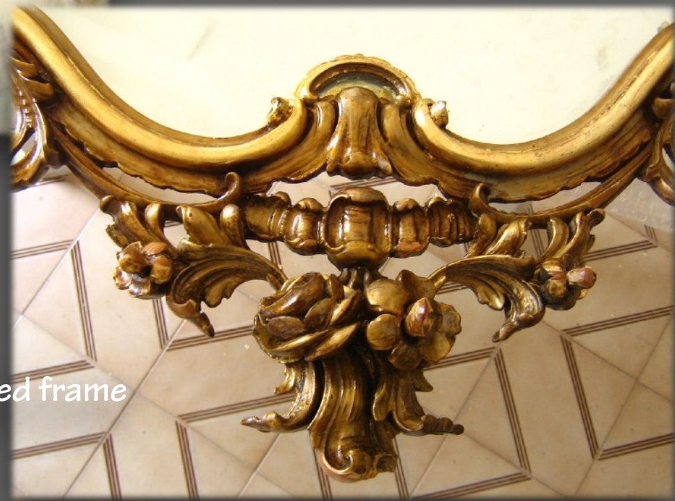
Restoration of Wooden Carved Gilded frame