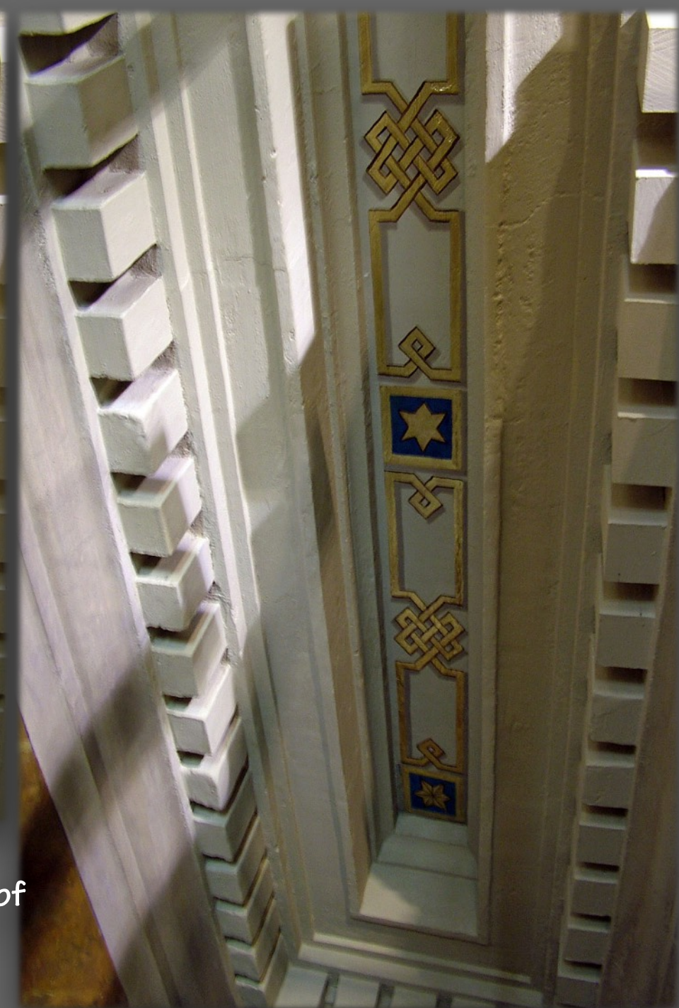
Sant'Anna Church during conservation and restoration treatments of gilded ornaments located on the ceilings