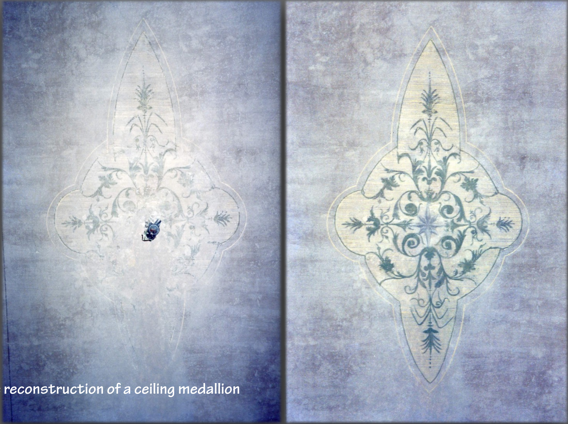
Decorative reconstruction of a ceiling medallion