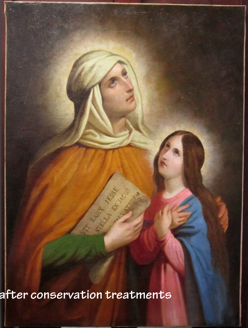
Sant'Anna oil on canvas before and after conservation treatments