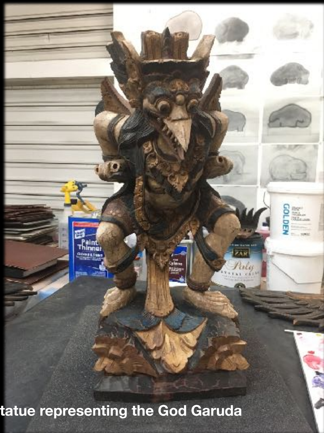
statue representing the God Garuda