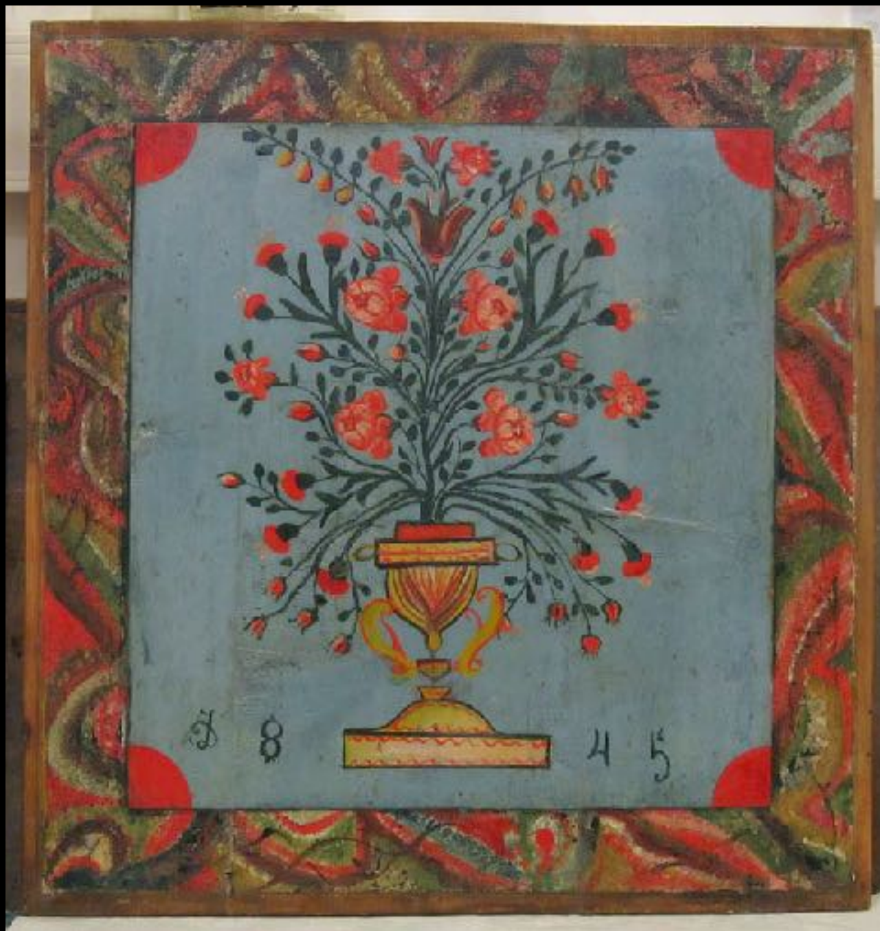
cleaning, consolidation and inpainting of 1800' painting on wooden board