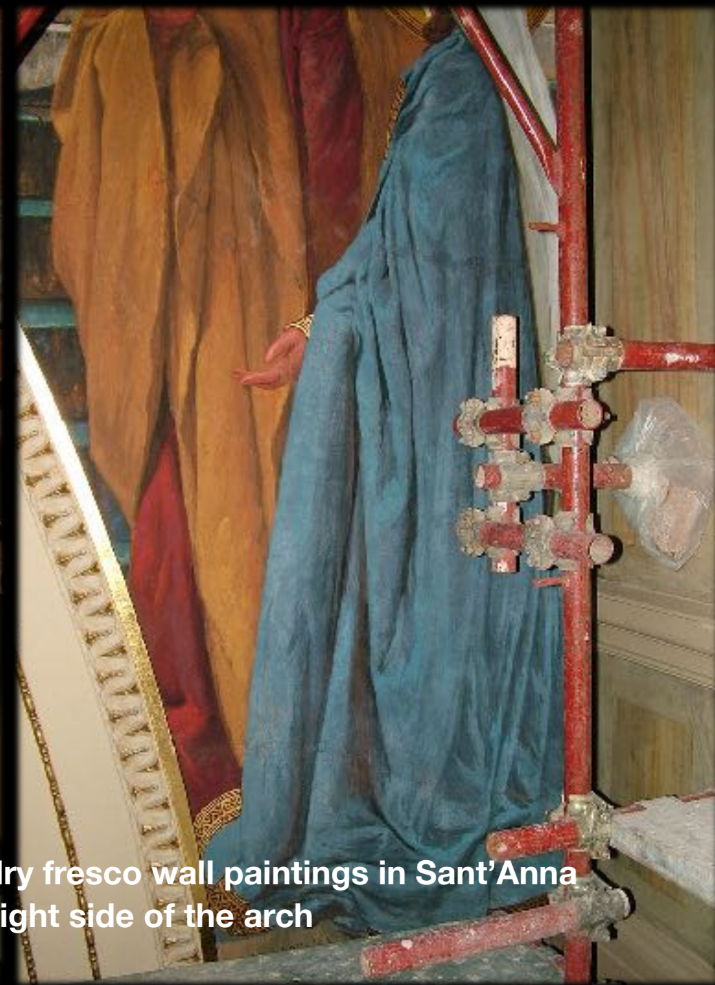
Consolidation and Restoration of dry fresco wall paintings in Sant'Anna Church, detail of right side of the arch