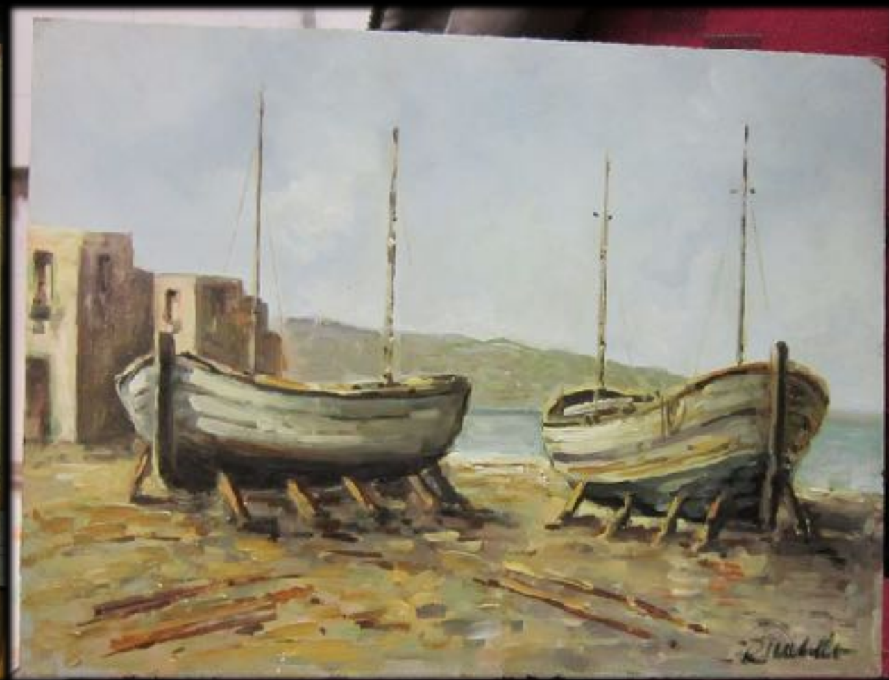
Cleaning of an oil painting on wood board