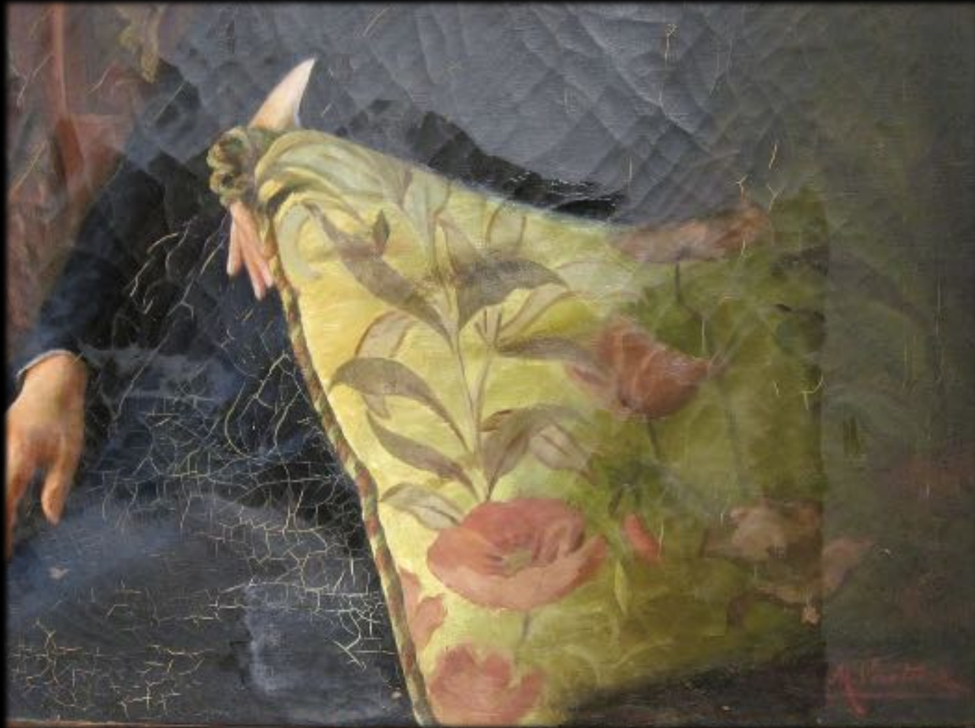
cleaning tests of an oil painting oxidized varnish