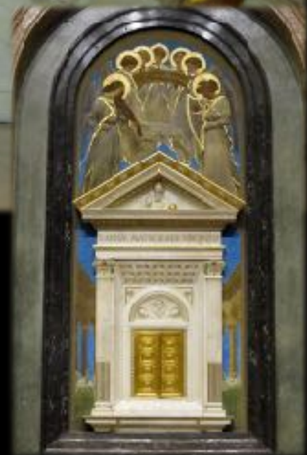
Edicola of Sant'Anna, before and after conservation treatments of marble architectural elements and gilded surfaces