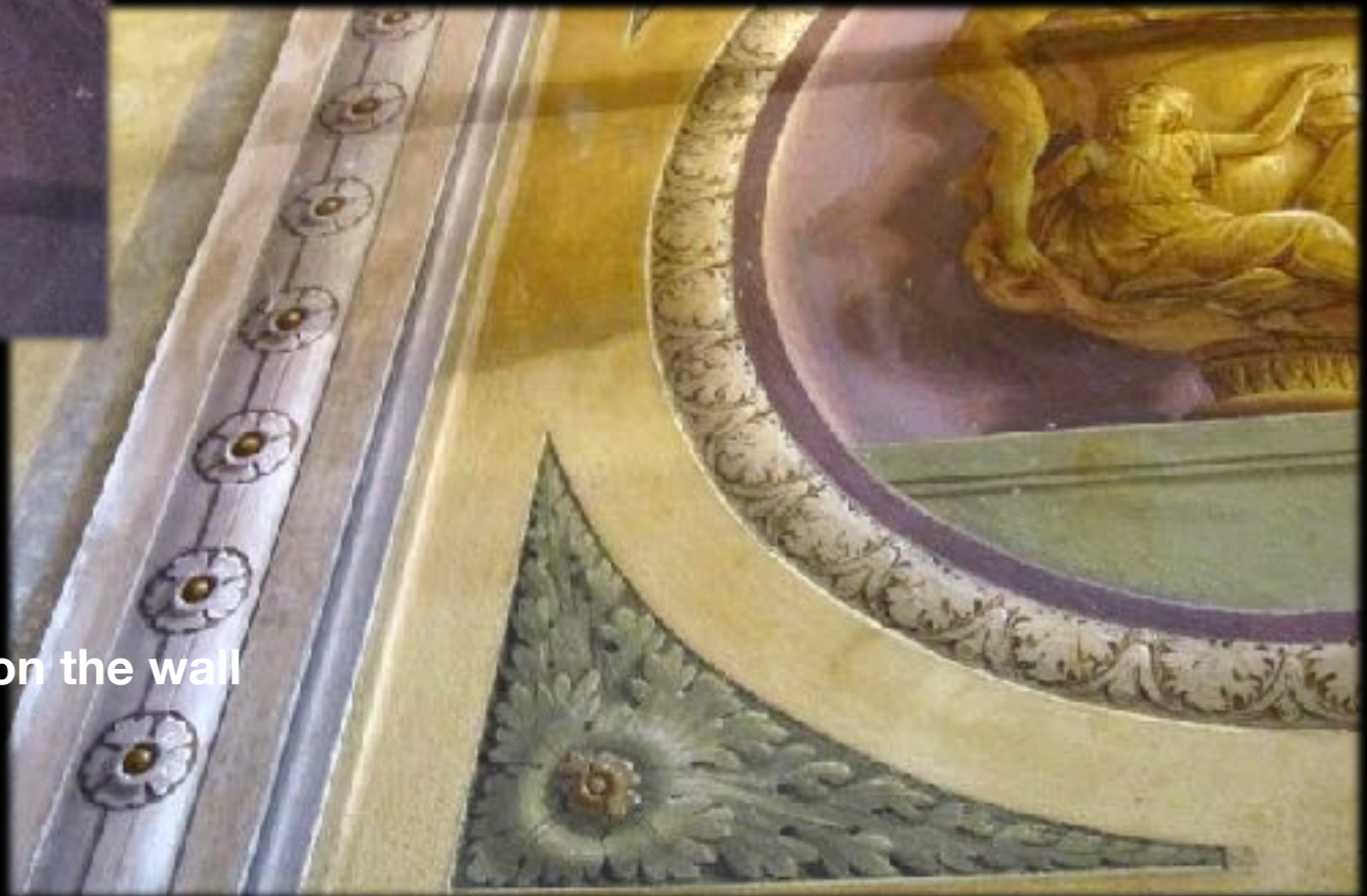
Palazzo Cordellina detail, cleaning of the fresco on the wall