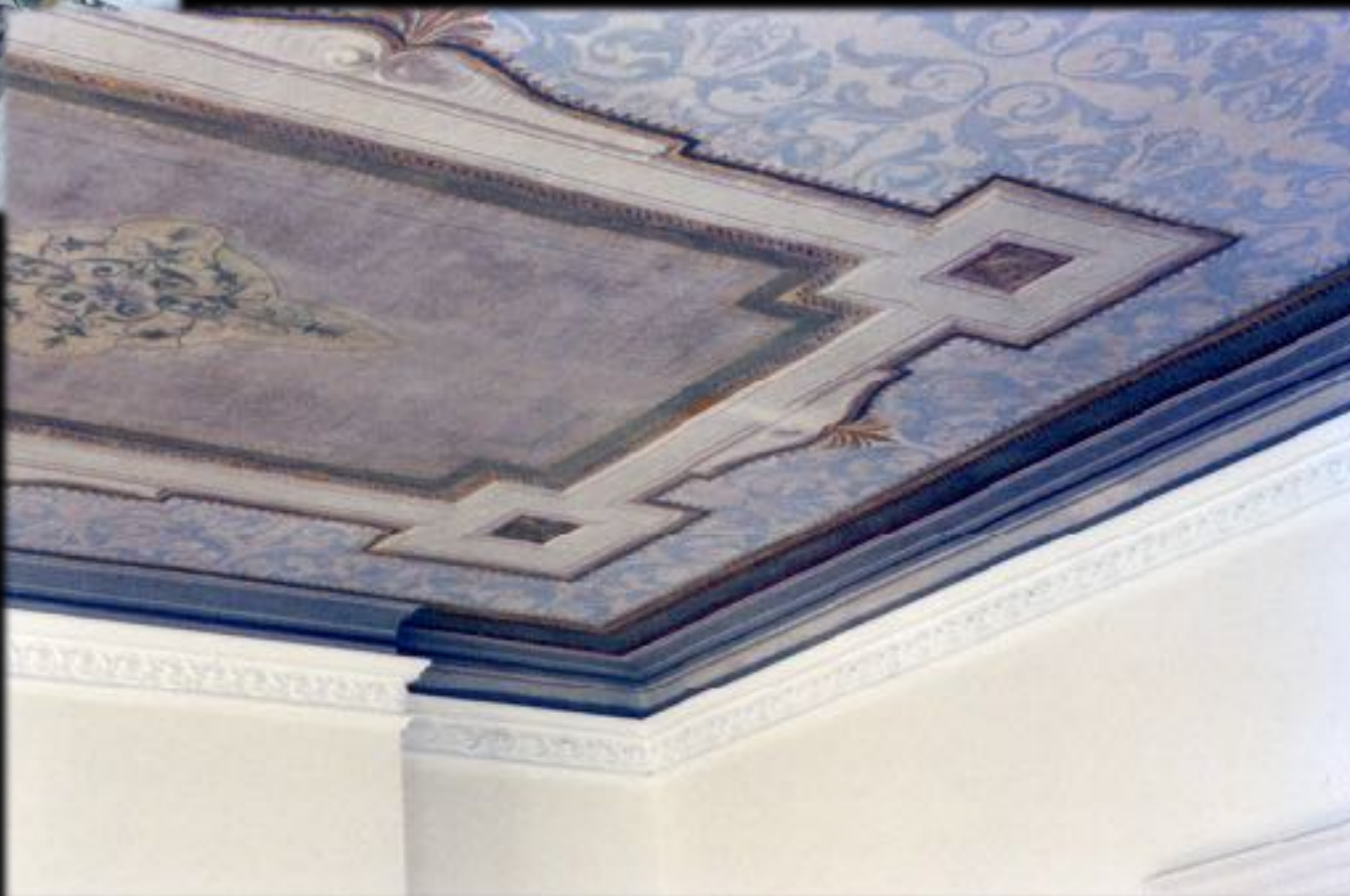
Conservation and restoration of decorative elements of an 1800' painted ceiling