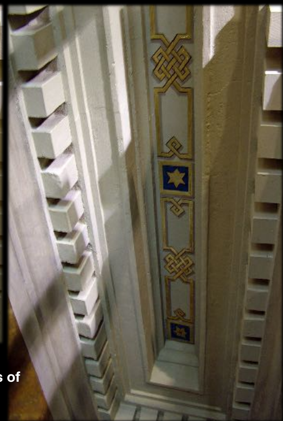
Sant'Anna Church during conservation and restoration treatments of gilded ornaments located on the ceilings