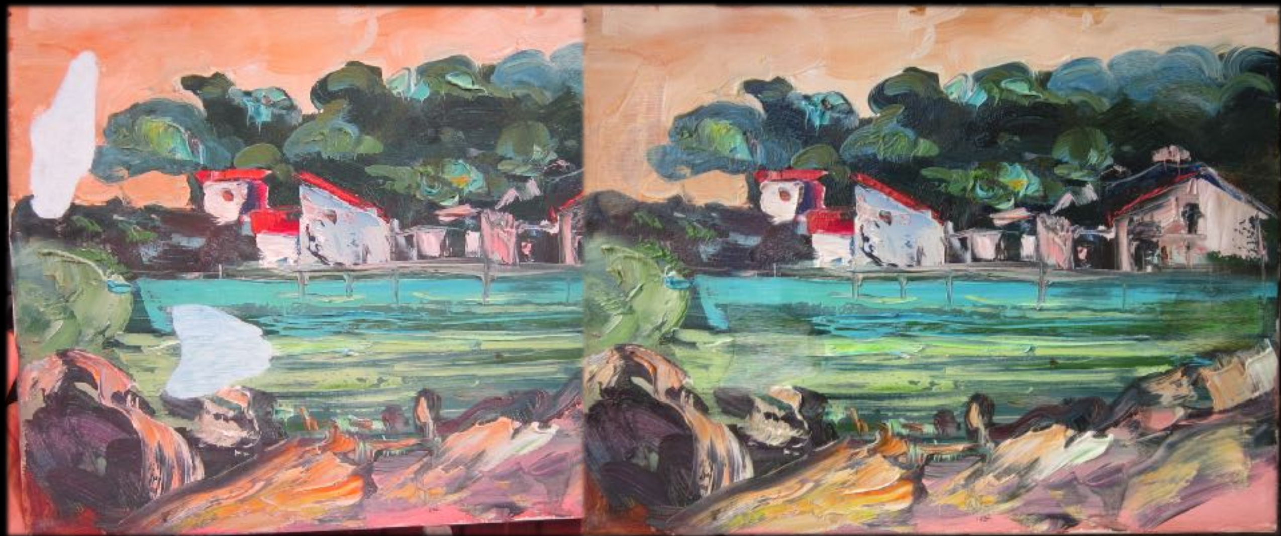
Pictorial integration of a contemporary painting