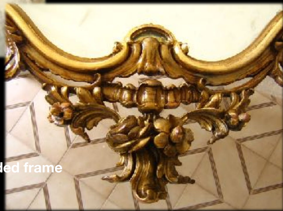
Restoration of Wooden Carved Gilded frame