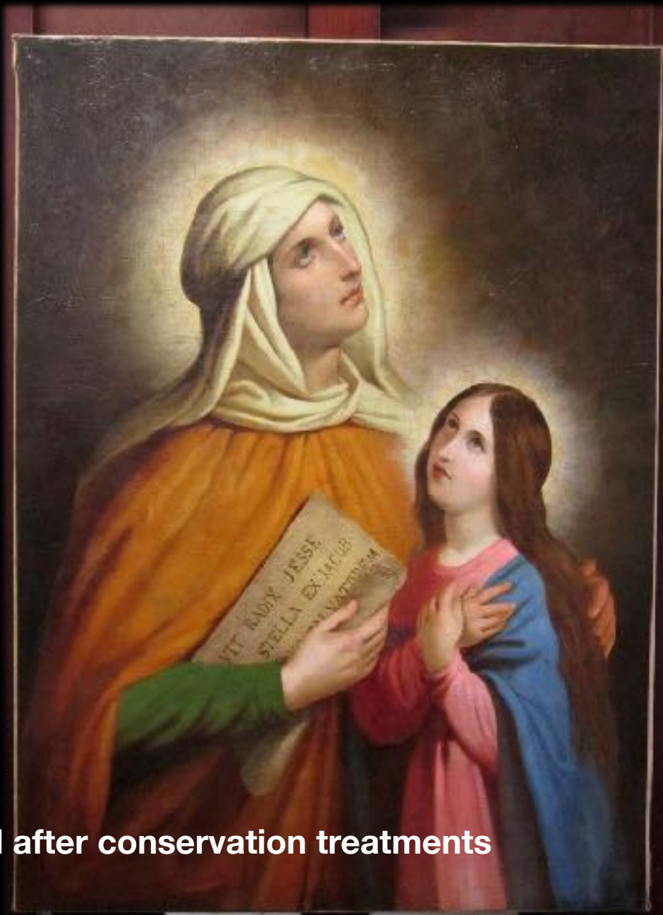
Sant'Anna oil on canvas before and after conservation treatments