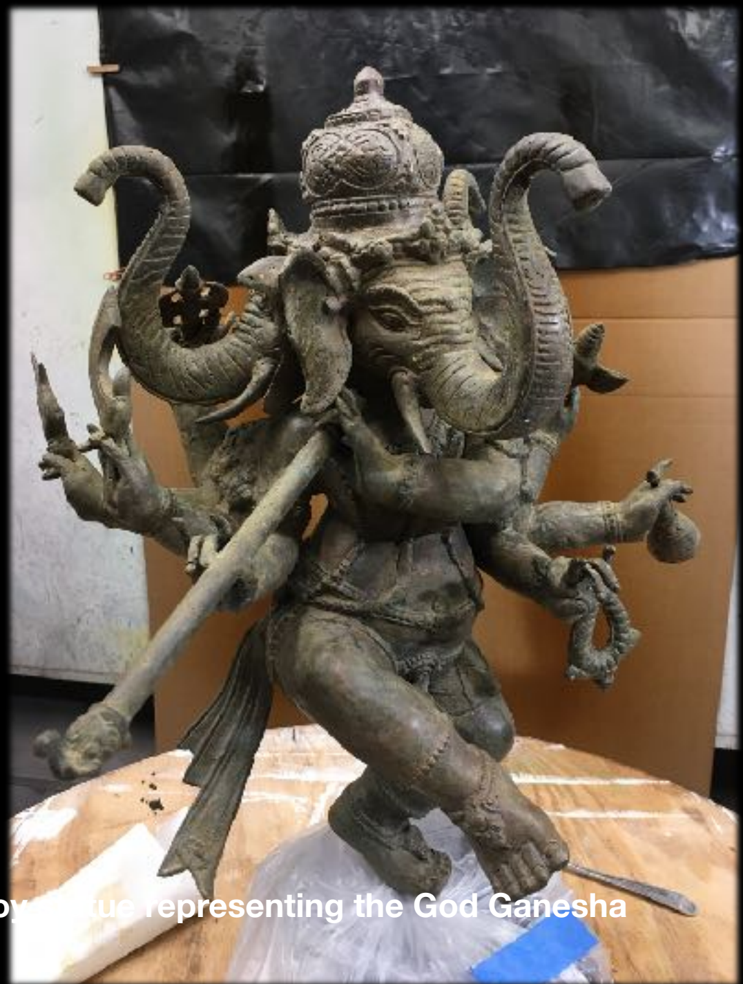
Restoration/Cleaning of Indu metal alloy statue representing the God Ganesha