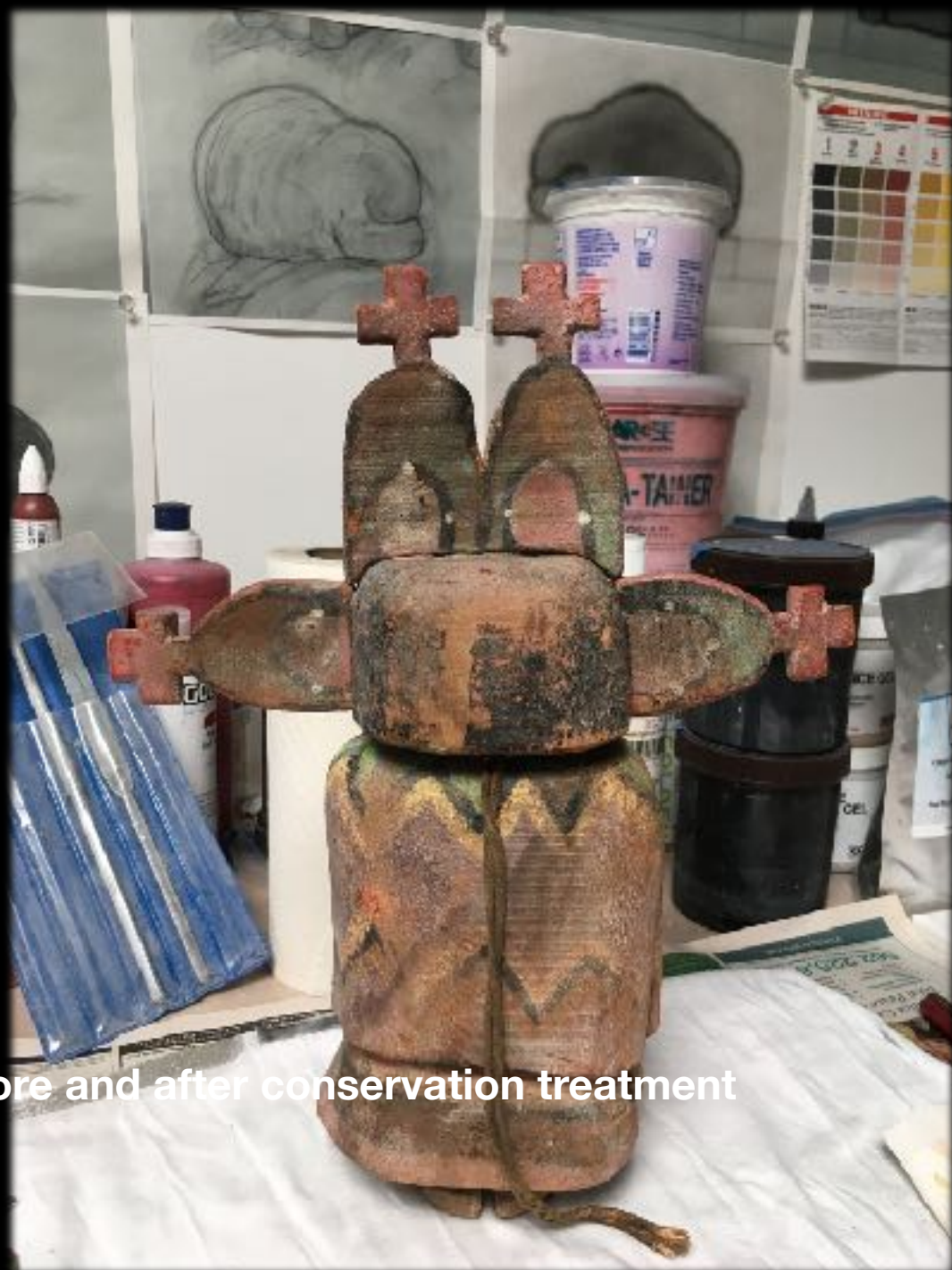
Hopi Kachina figure back side, before and after conservation treatment