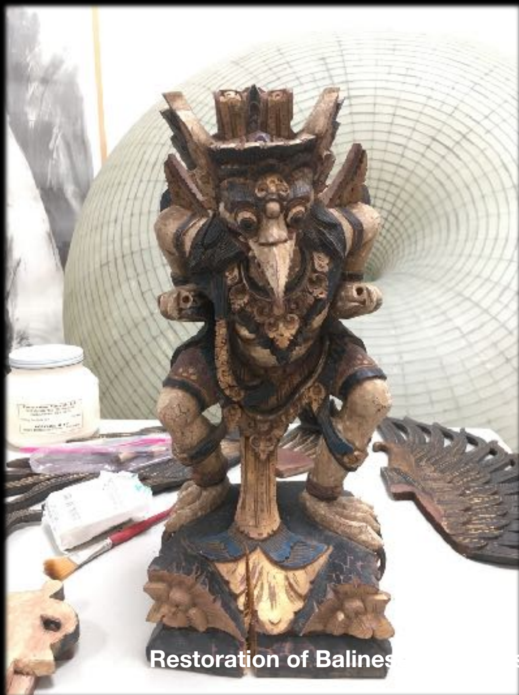
Restoration of Balinese