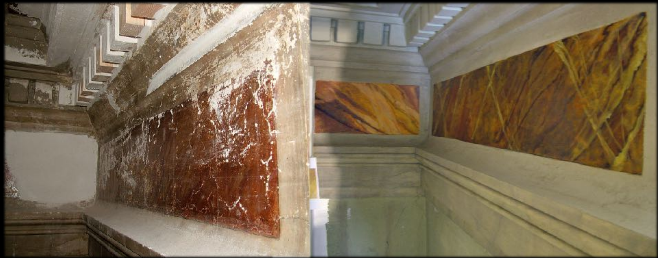
Sant'Anna Church stages of conservation and restoration treatments of wall faux finishes located on the wall's side facing the apse