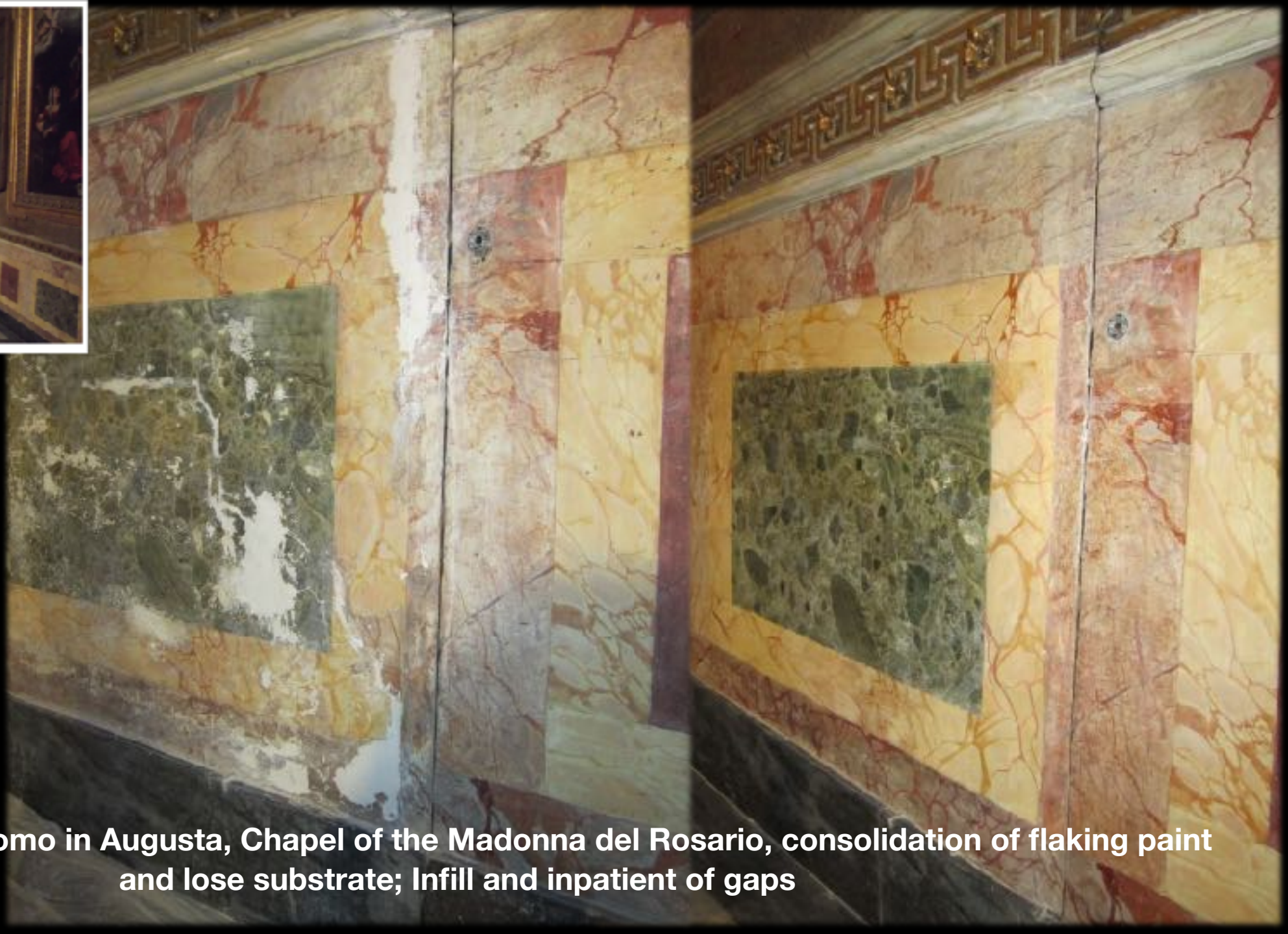
Church of San Giacomo in Augusta, Chapel of the Madonna del Rosario, consolidation of flaking paint and lose substrate; Infill and inpatient of gaps