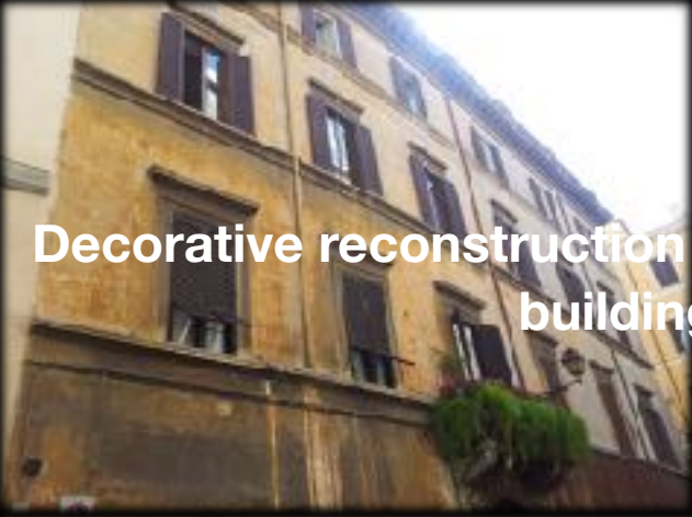
Decorative reconstruction of travertino faux finish of a building facade