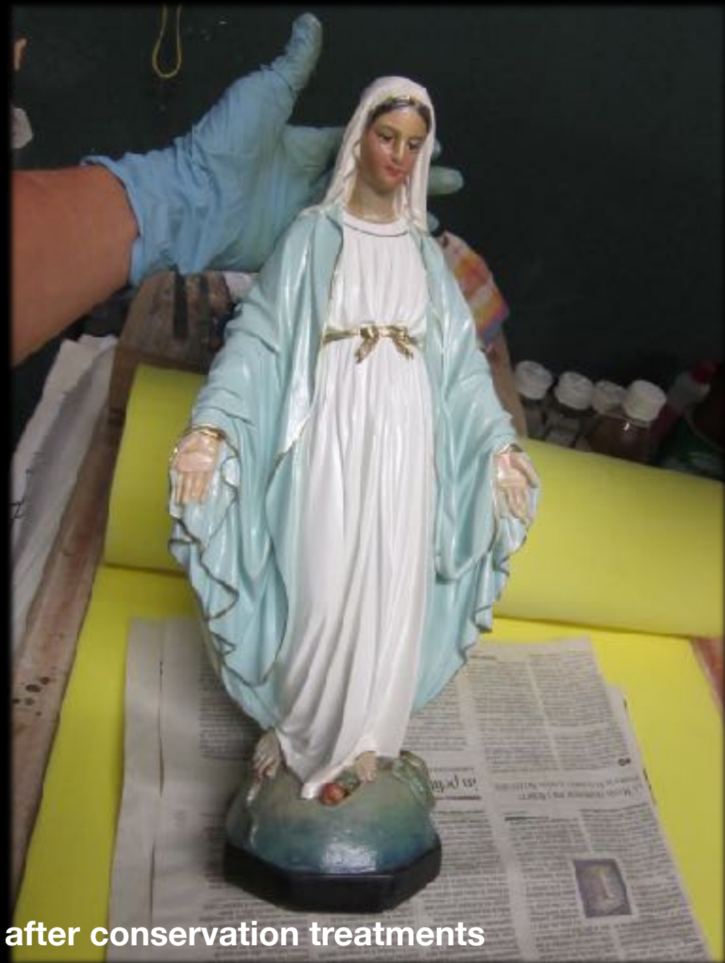
Virgin Mary Statue before and after conservation treatments