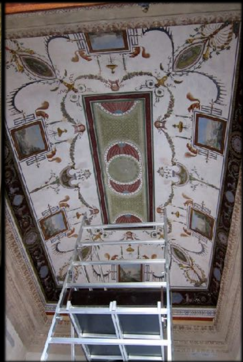
Restoration of Mural Paintings in Cordellina Palace