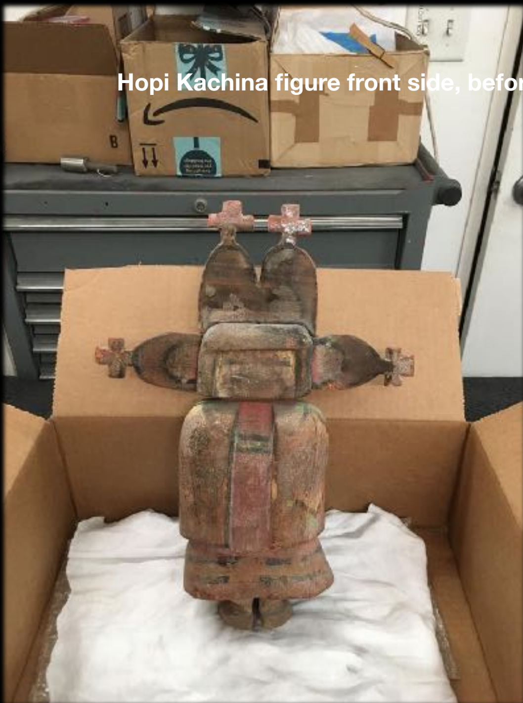
Hopi Kachina figure front side, before and after conservation treatment