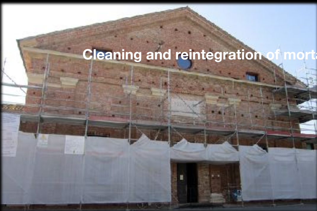
Cleaning and reintegration of mortar on the facade of Villa Thiene