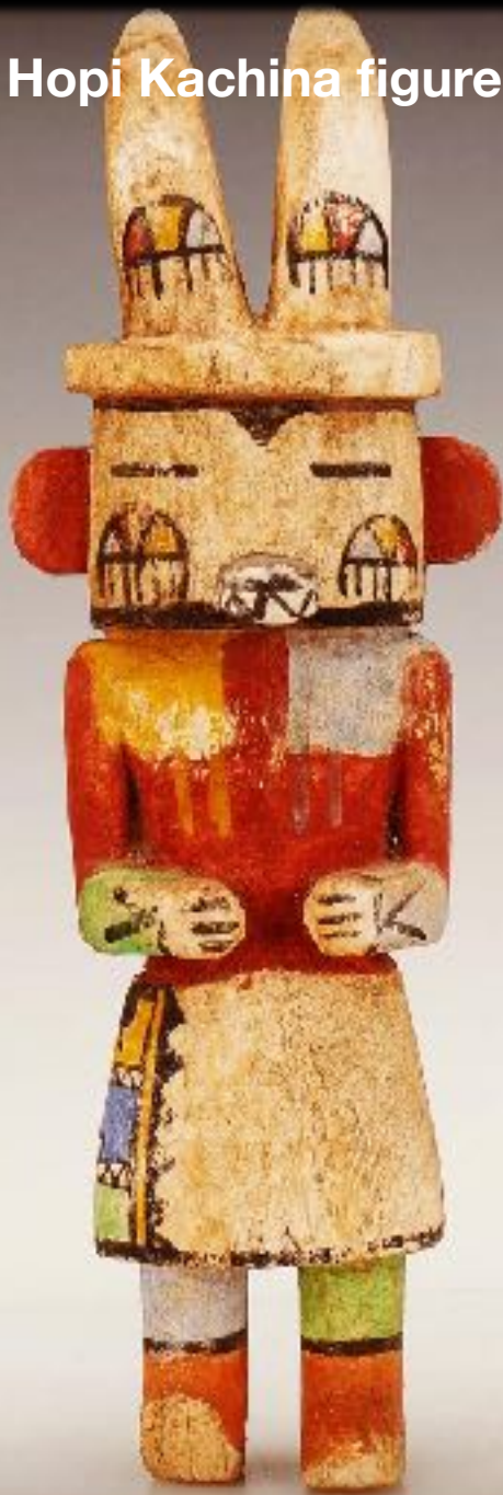
Hopi Kachina figure front side, before and after conservation treatment