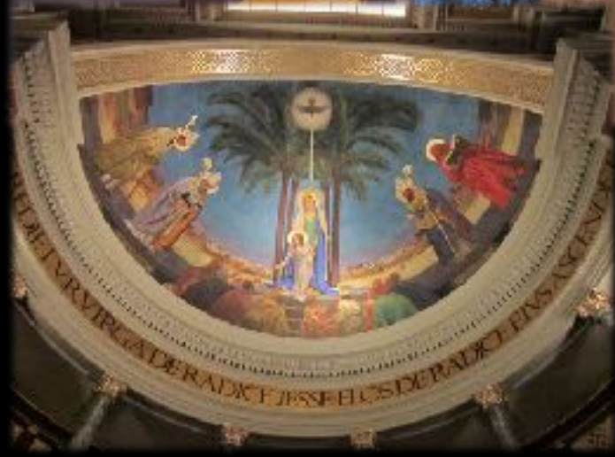
Consolidation and Restoration of dry fresco wall paintings in Sant'Anna Church, detail of apse mural