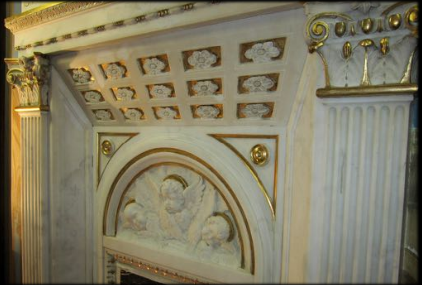
Edicola of Sant'Anna, before and after conservation treatments of marble architectural elements and gilded surfaces