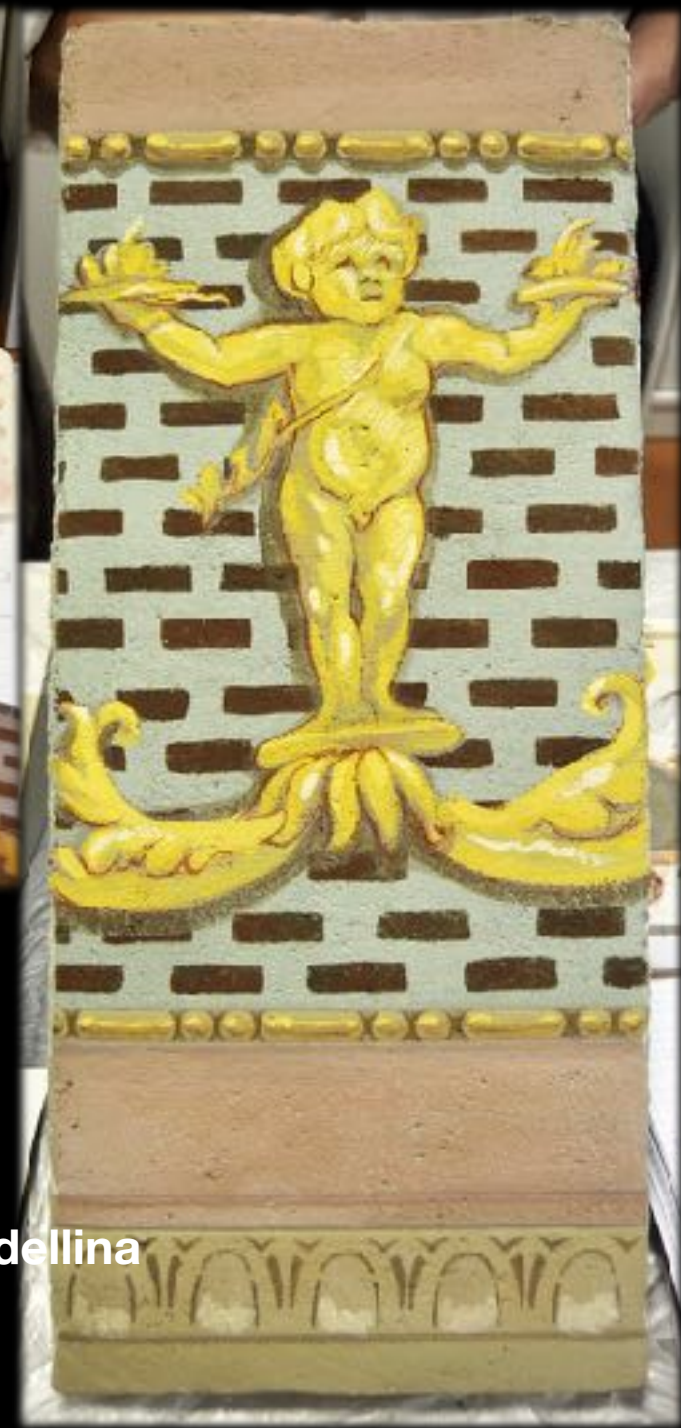
Some demonstrative steps of the realization of the frescoes in Palazzo Cordellina